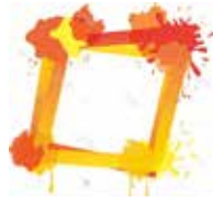
PHOTO FRAME: Make and decorate a personalized frame for a precious photo, 10.30am on Thurs 1 Aug.

PRINTING: print your design onto card using colourful inks and printing tiles on Fri 26 July at 2pm or Tues 6 Aug at 10.30am.