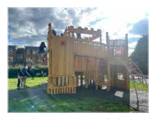
then all can enjoy the new facilities and we can carry on rejuvenating the rest of it.